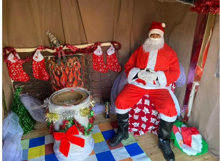
Look who came to our Winter Fair!