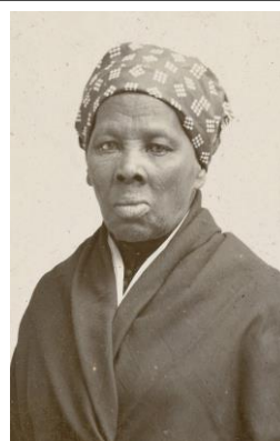
Harriet Tubman 1822 – 1913

Harriet Tubman was an African American who risked her life to lead many slaves to freedom on the Underground Railroad. Many called her 'General Tubman' as well as 'Moses' for her leadership qualities.