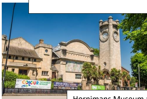
Hornimans Museum and Gardens

The guide is also available from all schools, libraries and youth hubs in the borough!