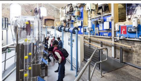
London Museum of Water and Steam

Are you worried about what to do during the Summer holidays?