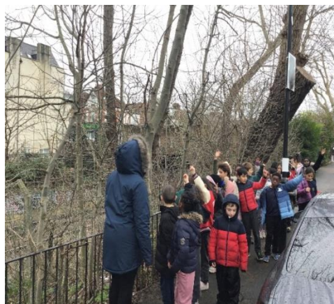
Year 2 Investigating Our Local Area in geography.