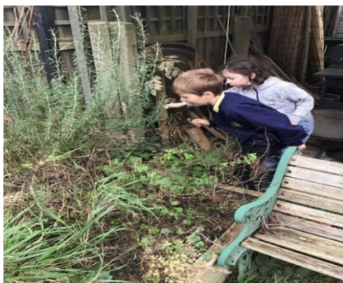
Using magnifying glasses to study plants

The children wrote some fantastic fantasy stories in Literacy, which were based on the stories 'The Dragon Machine' and 'George and The Dragon'. The children used similes to make their writing descriptive and interesting to read. Year 2 are using Emile Education online to continue to learn the multiplication tables and improve their spelling.