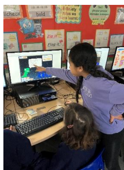
Safer Internet Day Session

We have been constructing circuits using a variety of components. We will explore different materials to decide which are conductors and which are insulators and how to make switches.