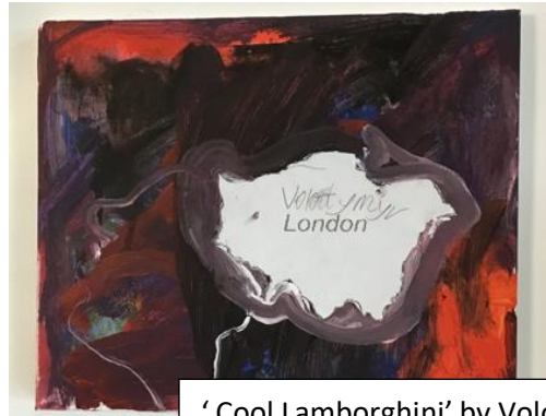
'Cool Lamborghini' by Volodymyr