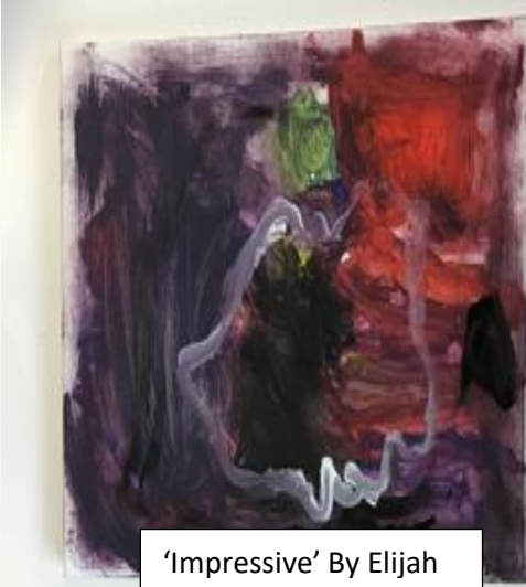
'Impressive' By Elijah