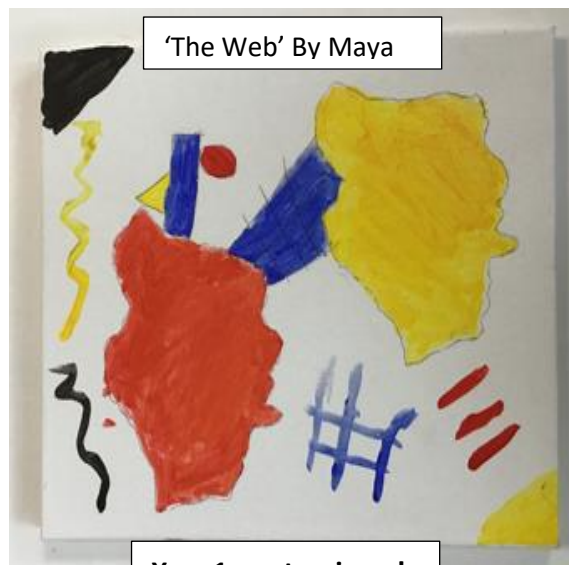
'The Web' By Maya

'We were using water colours and we mixed primary colours. My favourite part is we got to do painting' Elijah