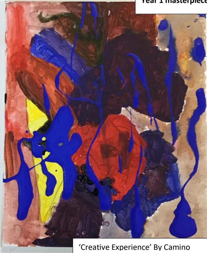
'Creative Experience' By Camino