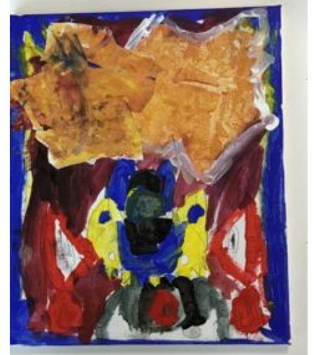
'Lightening Cat nap' by Aurora