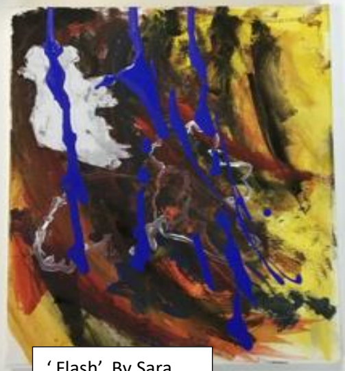
'Flash' By Sara